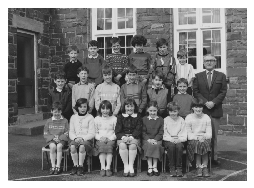
Figure 9: New Quay Primary School, 1986

By this time, further modifications had been made to the playground with the addition of painted football-pitch lines, 'marking out' the playspace to create distinct zones; another process of orchestration by adults. This created a shift in terms of how the children self-organised their play, where the 'top' of the yard became dominated by football-playing boys, thus preventing the space from being used freely by all children. Pawlowski