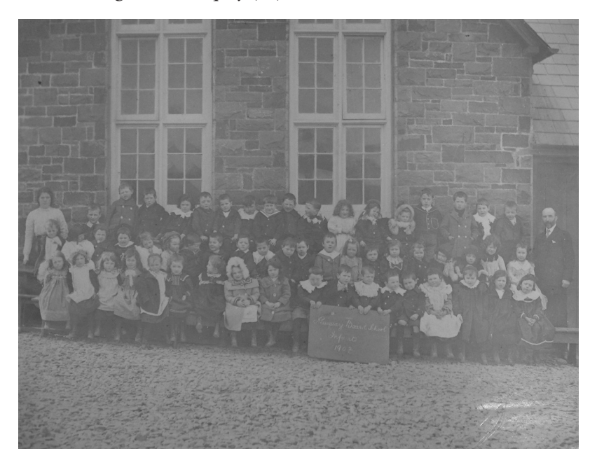
Figure 3: Newquay (sic) Board School Infants, 1903

Figure 3 captures a large group of 55 children (boys n=27; girls n=28). Indeed, the group is so large that the photographer had to compose a long-shot, making it less easy to observe small details but showing more of the setting. Given the infant age-range of these children, some sense of disorder in captured (such as finger-chewing, misdirected gaze, 'informal' facial expressions, and