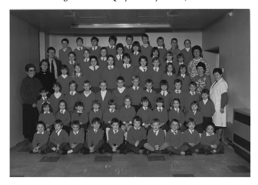
Figure 10: New Quay Primary School, 1989

Up to this point, Figures 1-9 reflect particular clothing codes that enable sociologists to place the images roughly within a given timeframe/era. Figure 10, however, represents a visual departure by introducing a school