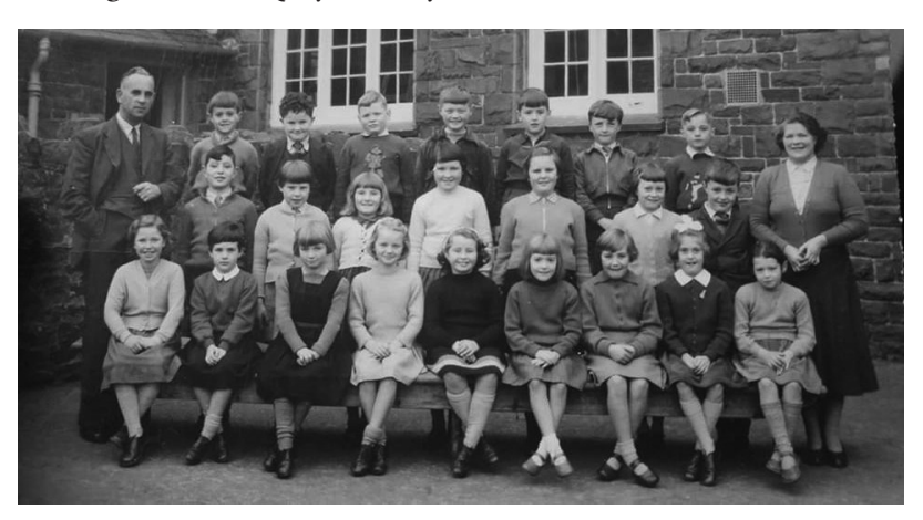
Figure 7: New Quay Primary School, Standards II & III, 1956

Figure 7 represents the second-generation familial connection to education provision in the town, featuring my mother at the age of 8-years-old.