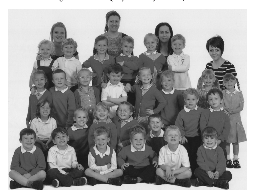
Figure 11: New Quay Primary School, 2015

number of registered children. For the first time in the montage, and reflecting changes in the way that schools are staffed, there are three teaching assistants (TAs) in addition to one classroom teacher. Whereas previous examples captured relatively large classes run by single teachers, this is no longer the norm. Employing additional support reflects two key shifts. Firstly, with the introduction of the Disability Discrimination Act in 1995, superseded by the Equality Act 2010, schools are required to make 'reasonable adjustments' to support children with additional learning needs. This often involves TAs being appointed to work with individual children. Secondly, the additional support responds to the more 'active' nature of the contemporary (early years) curriculum, such as the introduction of the Foundation Phase in Wales in 2010, where learning is play-based and experiential and numerous activities run simultaneously, requiring a level of adult supervision.