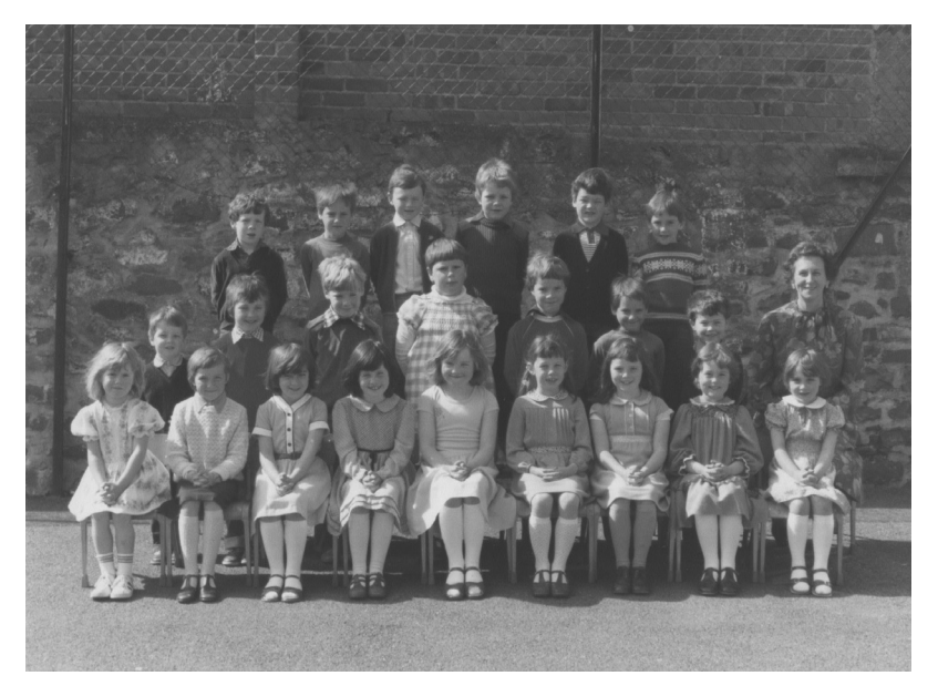
Figure 8: New Quay Primary School, 1980

codes reflect the early-1980s era, with some consistencies (such as girls wearing knee-length white socks), enabling the image to be located in the montage despite the absence of obvious date-markers. A different backdrop-wall in the school playground is featured because, had the photograph been taken against the wall of the main school building (cf. Figures 2, 3, 4, & 7), the children would have been squinting into the sun.