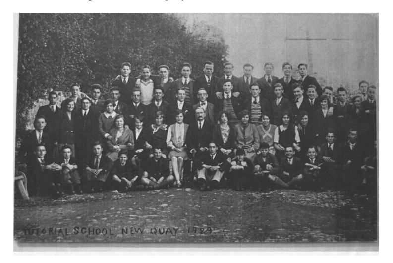
Figure 6: New Quay Tutorial School, 1929

Figure 6 maintains a focus on Tutorial School but was captured 19 years later, after the school had relocated to a new building (a corrugated iron shed). This photograph hangs on public display as part of the town's