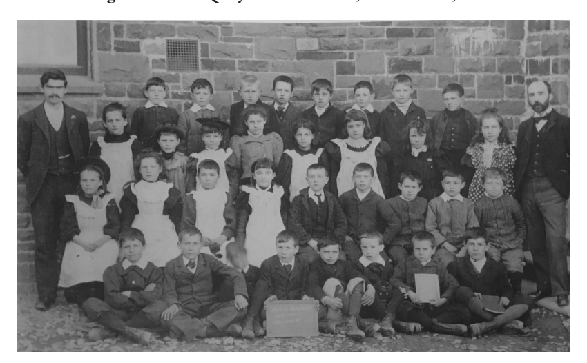
Figure 2: New Quay Board School, Standard V, 1899

The orderly seriousness of attending the school is neatly captured in this image.