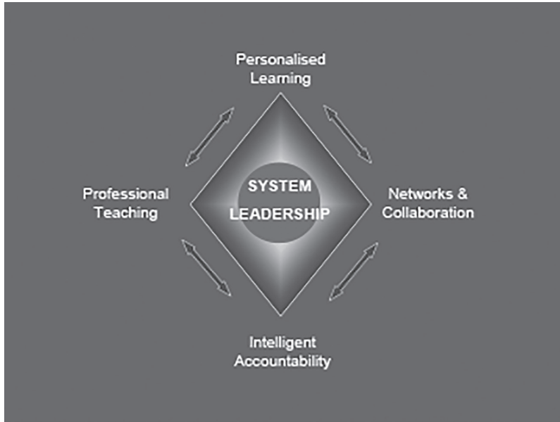
Figure 3 Four key drivers underpinning system reform

proposal here is to identify a limited number of domains for reform, within which the twenty actions could be coherently brigaded. The four drivers of personalised learning, professionalised teaching, networks and collaboration and intelligent accountability provide the core strategy for systemic improvement in most high-performing, ‘good to great’ educational systems. They are the canvas on which system leadership is exercised. As seen in Figure 3, the ‘diamond of reform’, the four trends coalesce through the exercise of responsible system leadership. To reiterate the two crucial points: first, single reforms do not work – it is only clusters of linked policy initiatives that will provide the necessary traction; second, it is system leadership, however, that drives implementation and adapts policies to context.